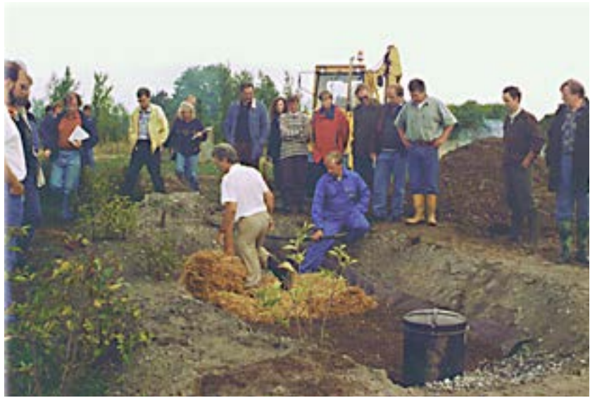
ROTZONEN I PEGASUS TRÄDGÅRD I HÖG